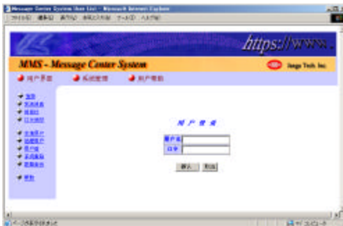
Sample Page of MCS