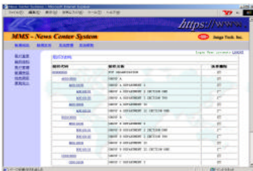
Sample Page of NCS